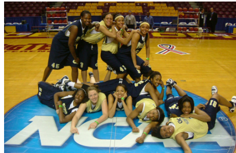
The Yellow Jackets made it to the NCAA Tournament in 2007 which was the first of six-straight apperances in the Big Dance from 2007-12.