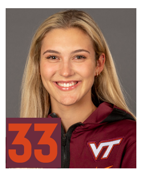
JR. • C • 6-6 GREENSBORO, N.C. NORTHWEST GUILFORD