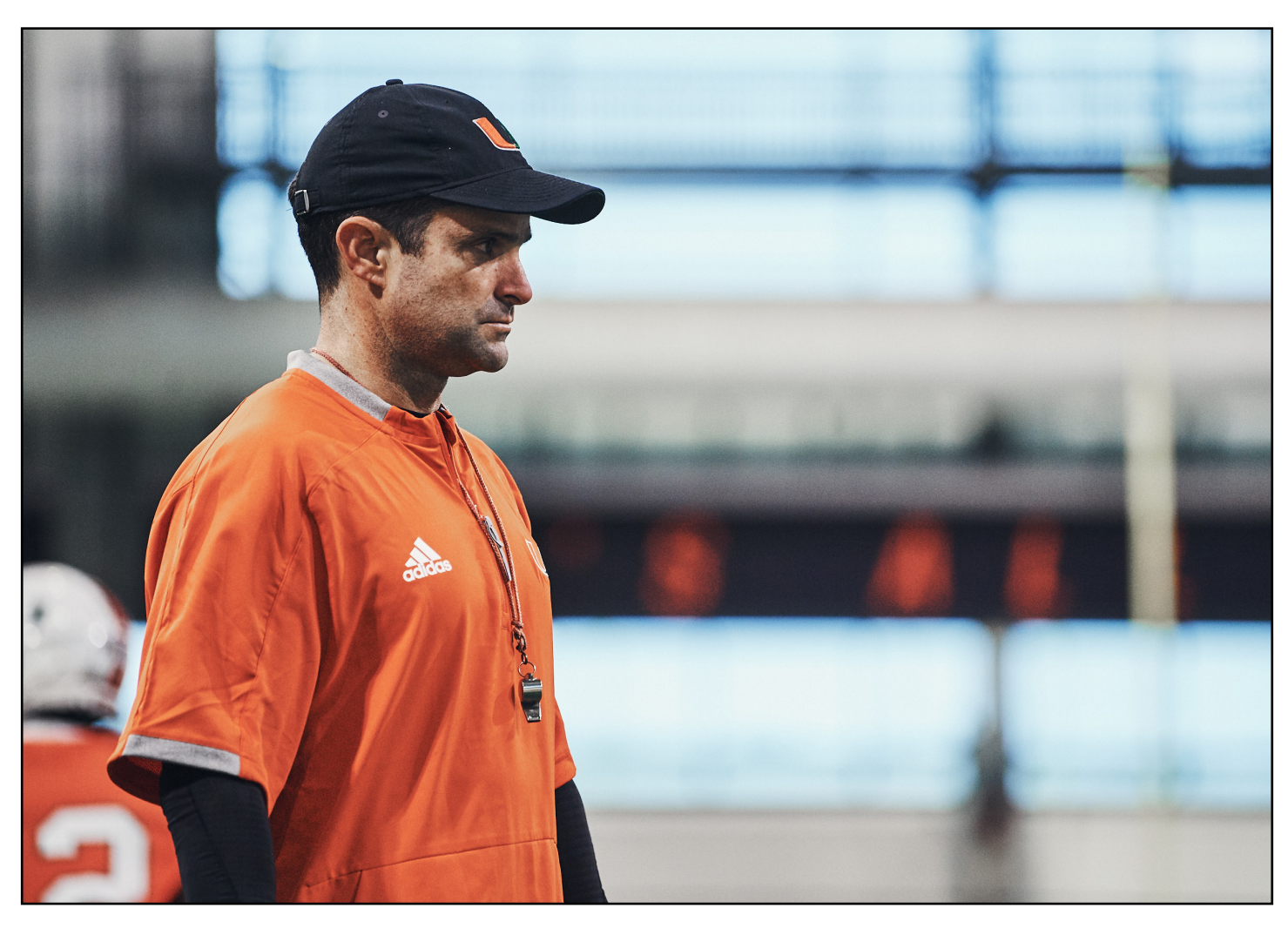
23.2 points per game and ranked in the nation's top 10 in red zone defense and tackles for loss.

Diaz spent one season, 2014, at Louisiana Tech and his impact was felt in a big way. The Bulldogs led the nation in turnovers gained (42) with 16 fumble recoveries and 26 interceptions. Before his stop at Louisiana Tech, Diaz coached three seasons at Texas (2011-13). His 2011 defensive unit ranked ninth in total yards per play.