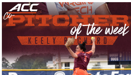
Feb. 12 & Feb. 19