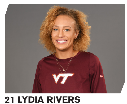
F | 6-2 | Grad Kinston, N.C. (Kinston/Radford)