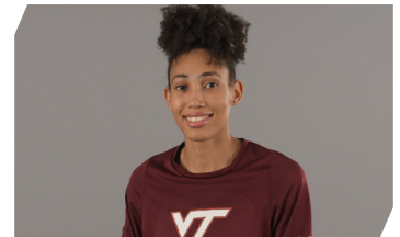
NO. 14 KINDER