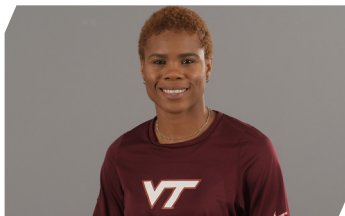
NO. 23 CAMP