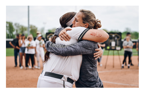
MAY 7, 2024