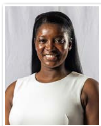
Head Coach DeLisha Milton-Jones (Florida, 1997)