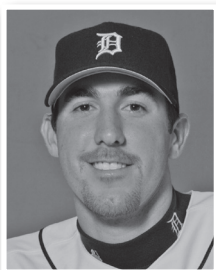
Justin Verlander '04 Pitcher for the Houston Astros