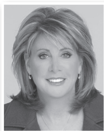
Nancy Lieberman '80 Basketball Hall of Famer