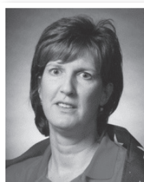
Anne Donovan '83 Basketball Hall of Famer Olympic Gold Medalist