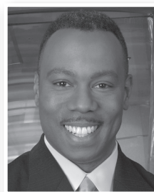
Jay Harris '87 ESPN Sportscaster