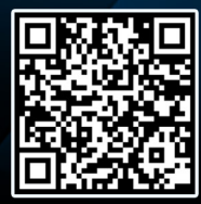
App Download QR Code

ODU Sports 360 mobile app lets you follow all Old Dominion sports in one place. Get rosters, real-time stats, schedules, fan guides, news and videos directly from the source. Listen to live radio broadcasts, no matter where you are.