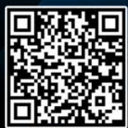
App Download QR Code

ODU Sports 360 mobile app lets you follow all Old Dominion sports in one place. Get rosters, real-time stats, schedules, fan guides, news and videos directly from the source. Listen to live radio broadcasts, no matter where you are.