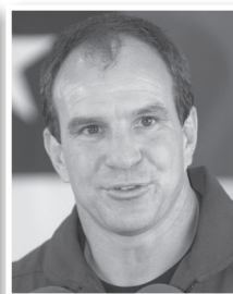
Michael J. Bloomfield '93 NASA Astronaut