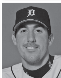
Justin Verlander '04 Pitcher for the Houston Astros