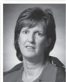
Anne Donovan '83 Basketball Hall of Famer Olympic Gold Medalist