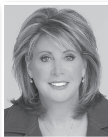
Nancy Lieberman '80 Basketball Hall of Famer