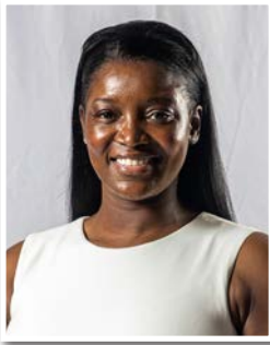
Head Coach DeLisha Milton-Jones (Florida, 1997)