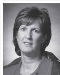
Anne Donovan '83 Basketball Hall of Famer Olympic Gold Medalist