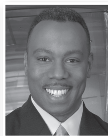
Jay Harris '87 ESPN Sportscaster