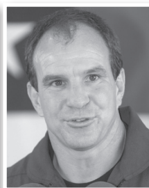
Michael J. Bloomfield '93 NASA Astronaut