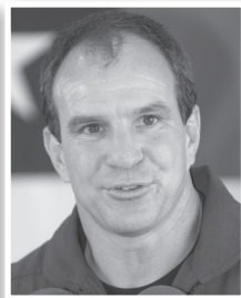
Michael J. Bloomfield '93 NASA Astronaut