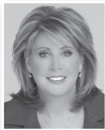
Nancy Lieberman '80 Basketball Hall of Famer