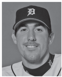
Justin Verlander '04 Pitcher for the Houston Astros