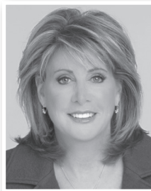
Nancy Lieberman '80 Basketball Hall of Famer