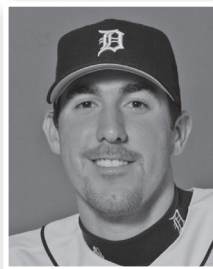
Justin Verlander '04 Pitcher for the Houston Astros