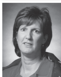
Anne Donovan '83 Basketball Hall of Famer Olympic Gold Medalist