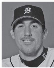
Justin Verlander '04 Pitcher for the Houston Astros