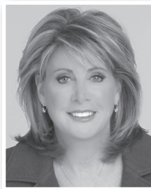
Nancy Lieberman '80 Basketball Hall of Famer