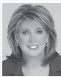
Nancy Lieberman '80 Basketball Hall of Famer