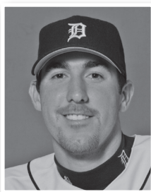
Justin Verlander '04 Pitcher for the Houston Astros