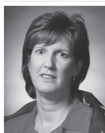
Anne Donovan '83 Basketball Hall of Famer Olympic Gold Medalist