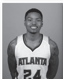
Kent Bazemore '12 Guard for the Portland Trailblazers