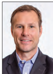
FRED HOIBERG Head Coach