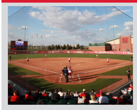
The 2022 season marks the 21st season Nebraska has called Bowlin Stadium home. The stadium's inaugural season was in 2002.

One of the top facilities in the country, Bowlin Stadium features seating for 2,500 fans, an underground system that heats the field and a large video board. Just past the right field fence is the Alex Gordon Training Complex, a spacious indoor facility that is large enough for Nebraska to take live batting practice inside the complex. The clubhouse features a locker room, players' lounge, training room and coaches' offices.