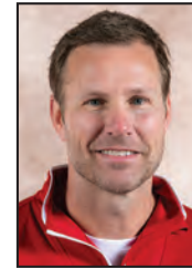
FRED HOIBERG Head Coach