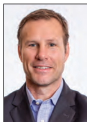
FRED HOIBERG Head Coach