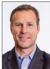
FRED HOIBERG Head Coach