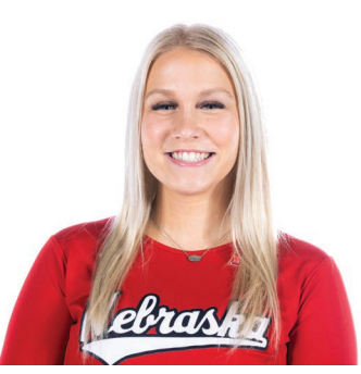
JR. • S • 5-9