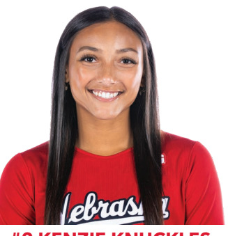
SR. • DS/L • 5-9