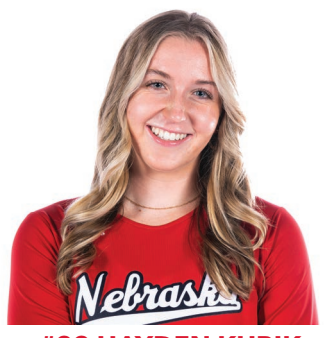
FR. • OH • 6-2