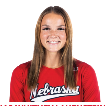
SO. • OH • 6-2