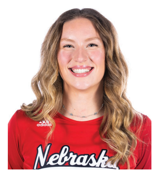
CAREER HONORS & AWARDS

FRESHMAN • MIDDLE BLOCKER 6-5 • OGDEN, UTAH