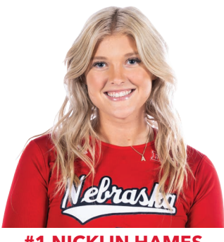
SR. • S/DS • 5-10