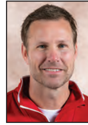
FRED HOIBERG Head Coach