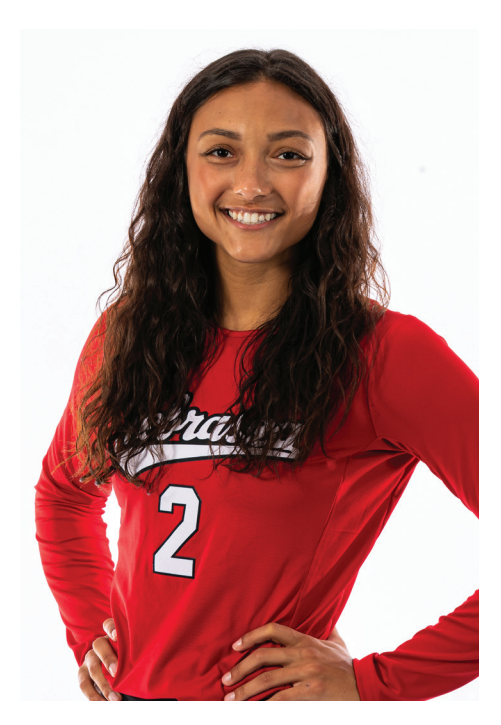
DS/L • Jr. • 5-8 Yorktown, Ind. Yorktown