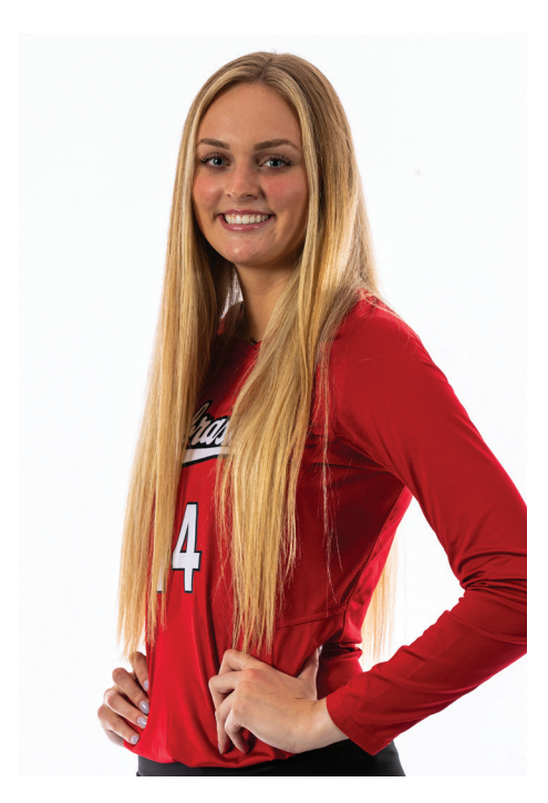
OH • Fr. • 6-4 Houston, Texas Seven Lakes