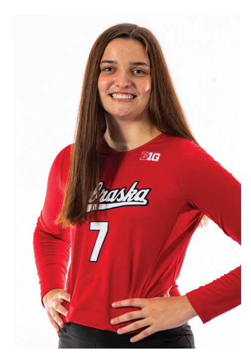
MB • Fr. • 6-4 Elkhorn, Neb. Elkhorn South