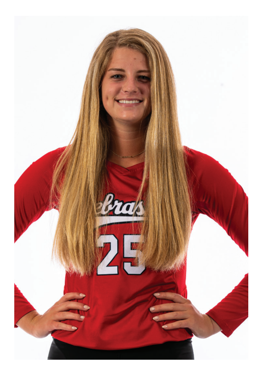
MB • Sr. • 6-5 Kearney, Mo. Kearney