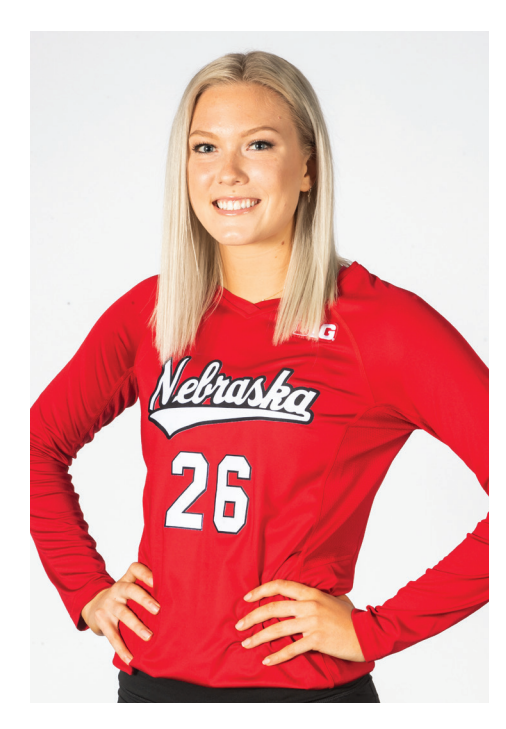
MB • Sr. • 6-4 Scottsdale, Ariz. Chaparral