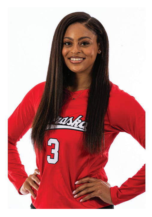
MB • Sr. • 6-0 Chicago, III. Mother McAuley/Missouri