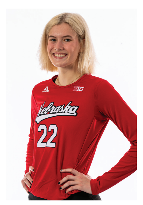
OH • Fr. • 6-4 Omaha, Neb. Skutt Catholic