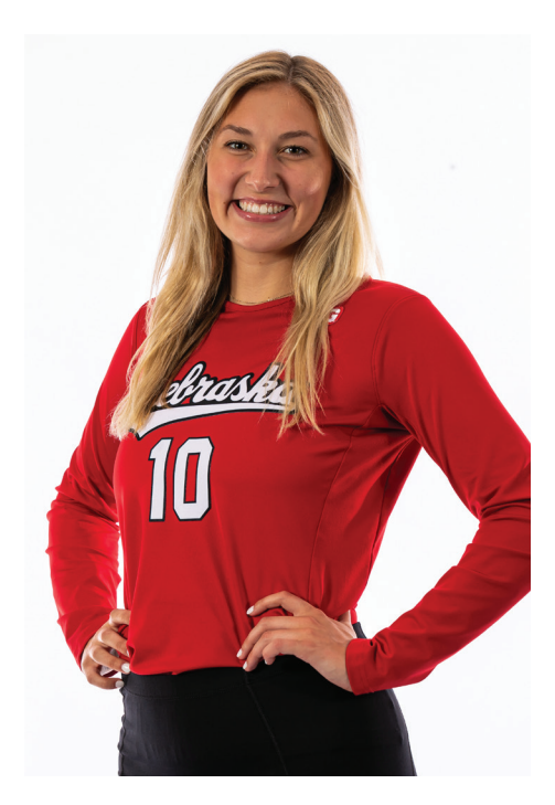
OH • Jr. • 6-3 West Des Moines, Iowa Valley