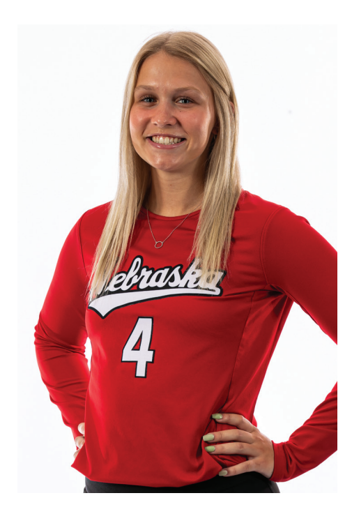
S • So. • 5-9 Waverly, Neb. Waverly