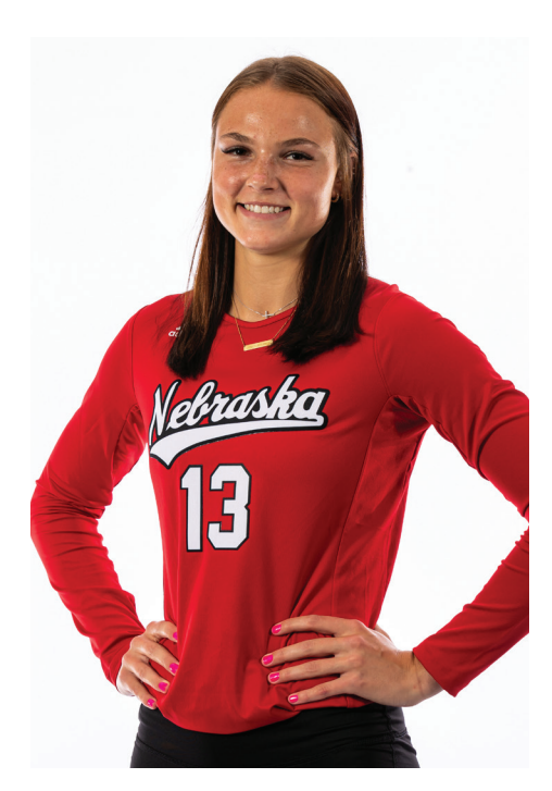
OH • Fr. • 6-2 Waverly, Neb. Waverly