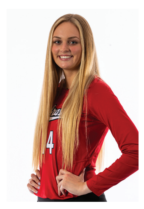
OH • Fr. • 6-4 Houston, Texas Seven Lakes