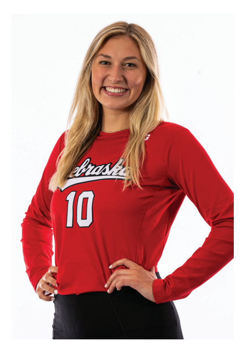
OH • Jr. • 6-3 West Des Moines, Iowa Valley