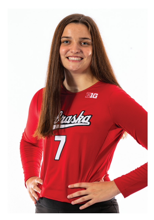
MB • Fr. • 6-4 Elkhorn, Neb. Elkhorn South