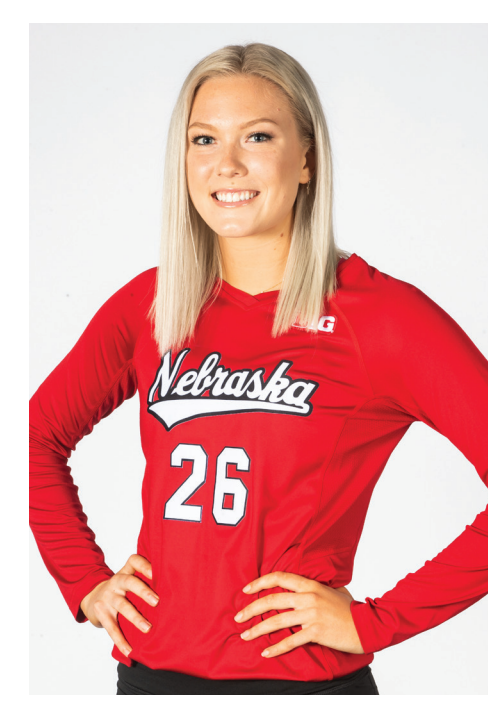
MB • Sr. • 6-4 Scottsdale, Ariz. Chaparral