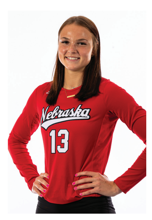
OH • Fr. • 6-2 Waverly, Neb. Waverly