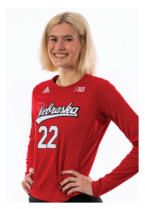
OH • Fr. • 6-4 Omaha, Neb. Skutt Catholic