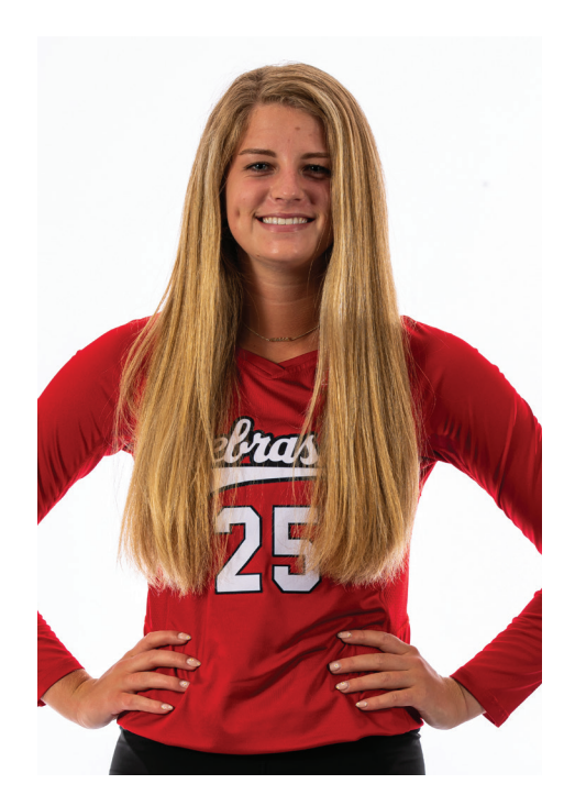
MB • Sr. • 6-5 Kearney, Mo. Kearney