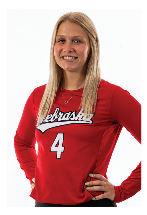
S • So. • 5-9 Waverly, Neb. Waverly