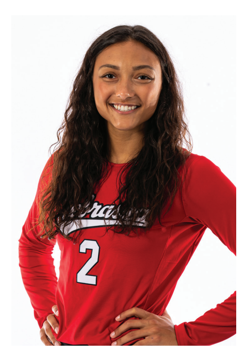
DS/L • Jr. • 5-8 Yorktown, Ind. Yorktown