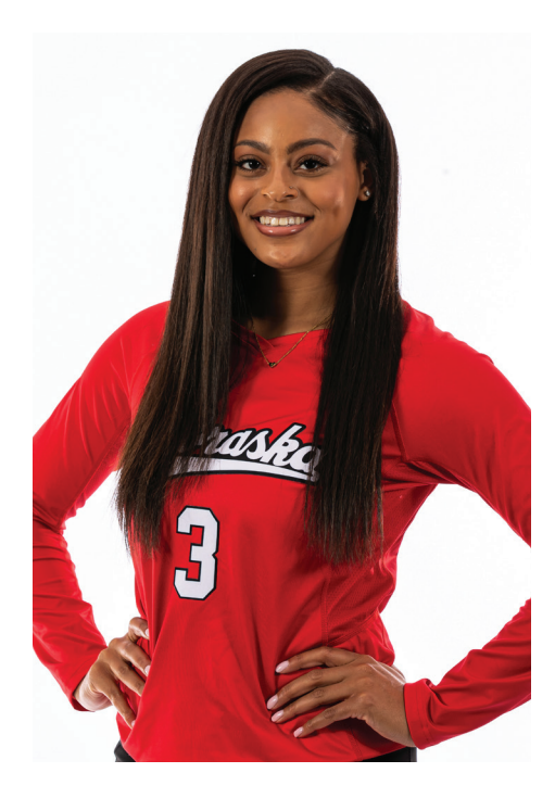
MB • Sr. • 6-0 Chicago, III. Mother McAuley/Missouri