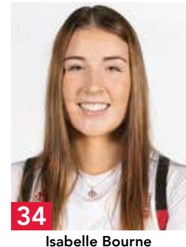
6-2, So., Forward Canberra, Australia