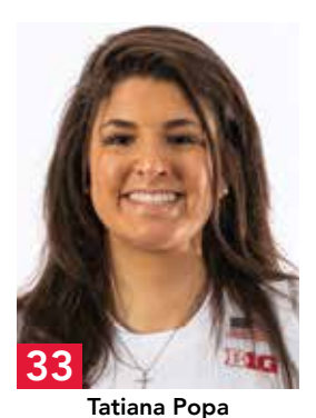
6-5, Fr., Center Parkersburg, West Virginia