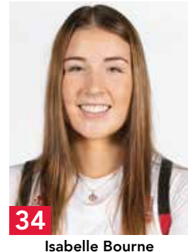
6-2, So., Forward Canberra, Australia