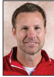
FRED HOIBERG Head Coach