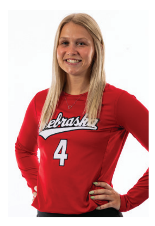
S • So. • 5-9 Waverly, Neb. Waverly