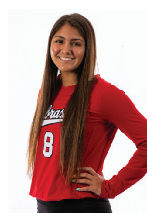
DS/L • Fr. • 5-5 Sterling, III. Sterling