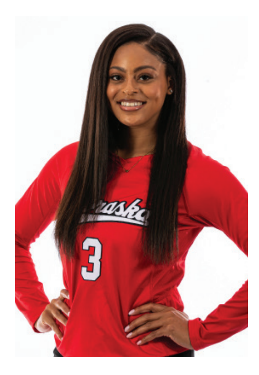
MB • Sr. • 6-0 Chicago, III. Mother McAuley/Missouri