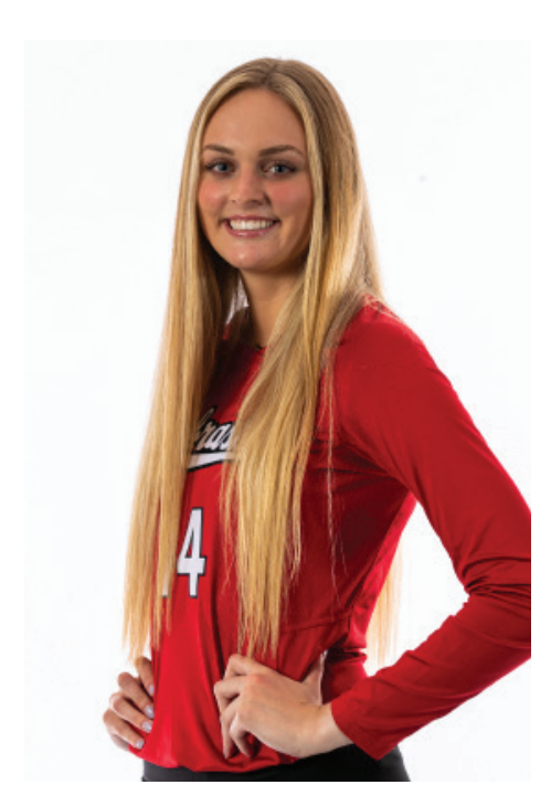
OH • Fr. • 6-4 Houston, Texas Seven Lakes