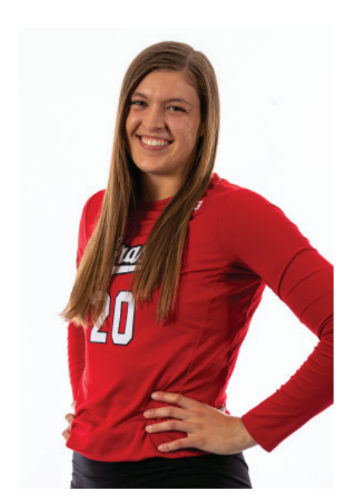
MB • So. • 6-3 Superior, Neb. Superior