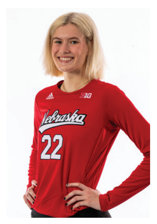
OH • Fr. • 6-4 Omaha, Neb. Skutt Catholic