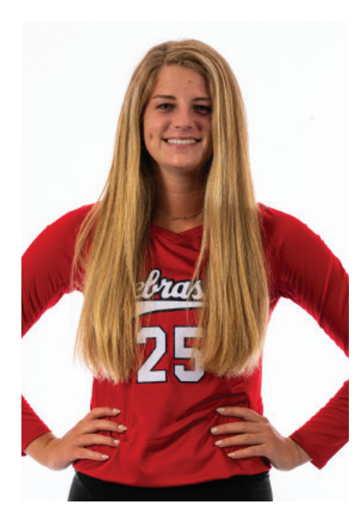
MB • Sr. • 6-5 Kearney, Mo. Kearney