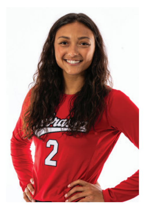
DS/L • Jr. • 5-8 Yorktown, Ind. Yorktown