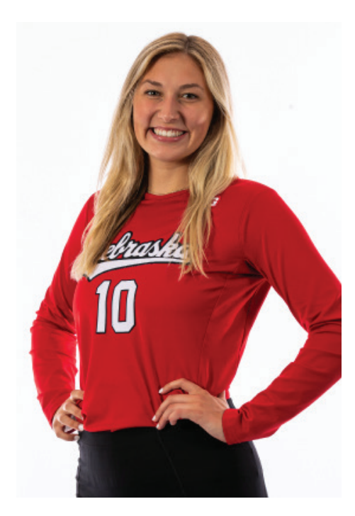
OH • Jr. • 6-3 West Des Moines, Iowa Valley