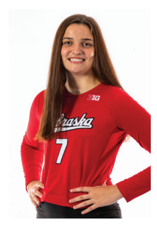
MB • Fr. • 6-4 Elkhorn, Neb. Elkhorn South