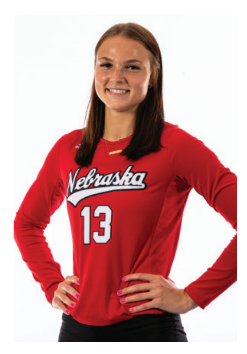
OH • Fr. • 6-2 Waverly, Neb. Waverly