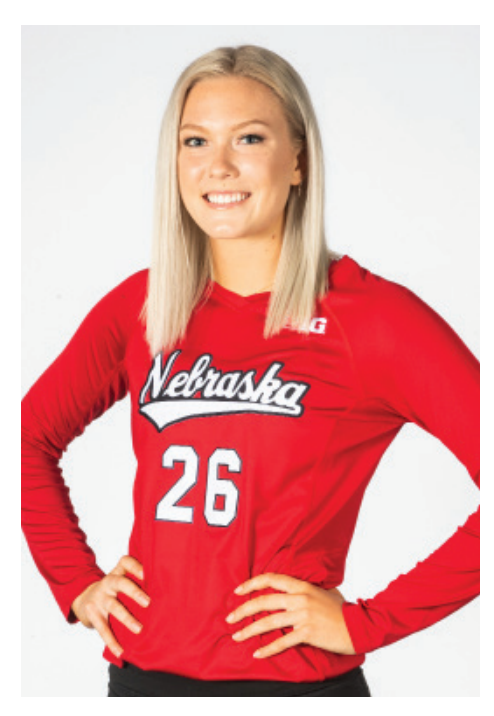
MB • Sr. • 6-4 Scottsdale, Ariz. Chaparral