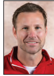
FRED HOIBERG Head Coach