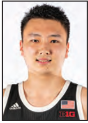
30 | KEISEI TOMINAGA So. | G | 6-2 | 178 Moriyama Nagoya Aichi, Japan