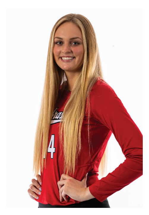
OH • Fr. • 6-4 Houston, Texas Seven Lakes