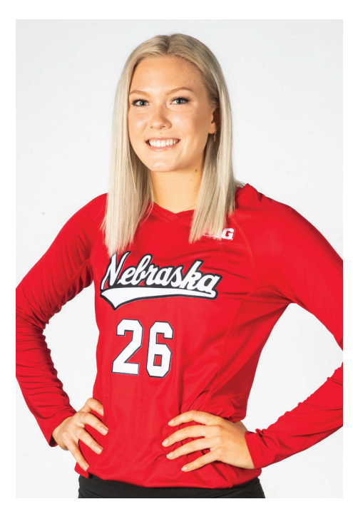
MB • Sr. • 6-4 Scottsdale, Ariz. Chaparral