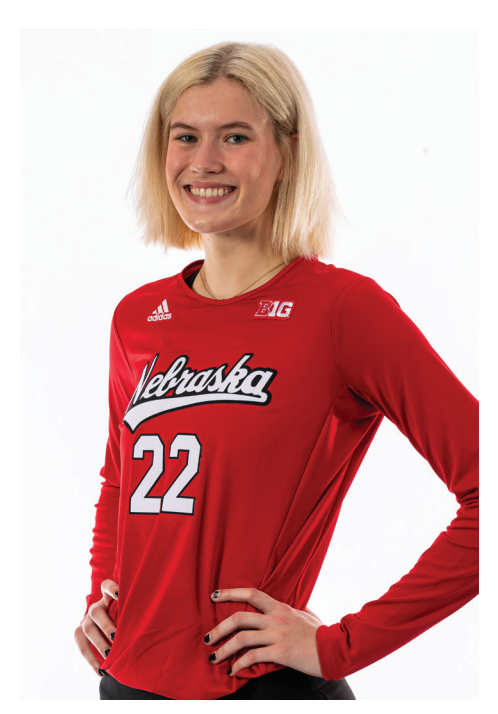
OH • Fr. • 6-4 Omaha, Neb. Skutt Catholic