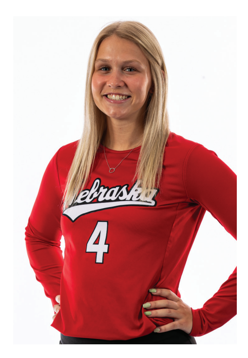
S • So. • 5-9 Waverly, Neb. Waverly