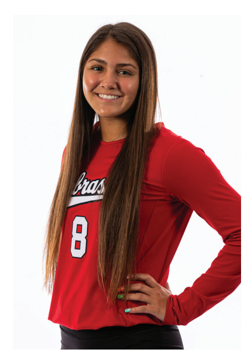
DS/L • Fr. • 5-5 Sterling, III. Sterling