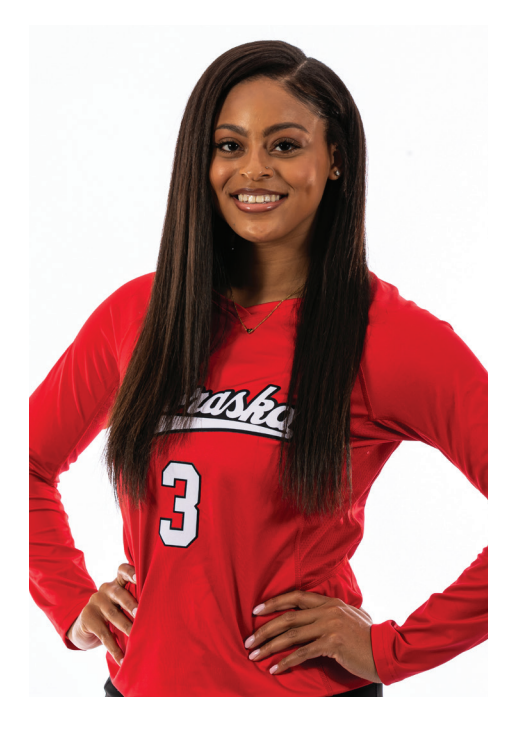
MB • Sr. • 6-0 Chicago, III. Mother McAuley/Missouri