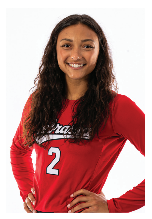
DS/L • Jr. • 5-8 Yorktown, Ind. Yorktown