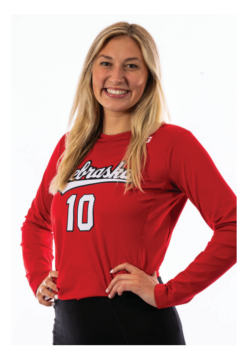
OH • Jr. • 6-3 West Des Moines, Iowa Valley