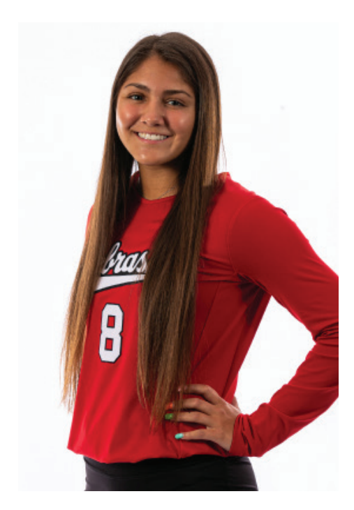
DS/L • Fr. • 5-5 Sterling, III. Sterling