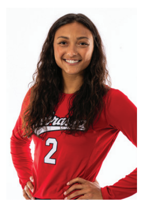
DS/L • Jr. • 5-8 Yorktown, Ind. Yorktown