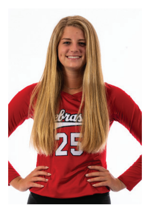
MB • Sr. • 6-5 Kearney, Mo. Kearney