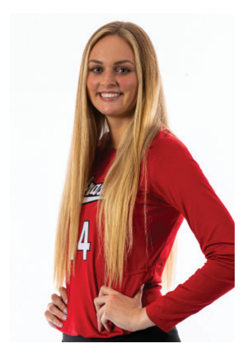
OH • Fr. • 6-4 Houston, Texas Seven Lakes