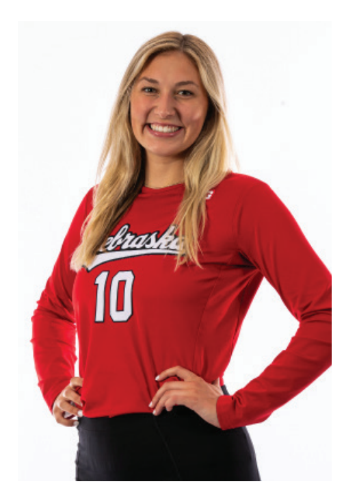
OH • Jr. • 6-3 West Des Moines, Iowa Valley