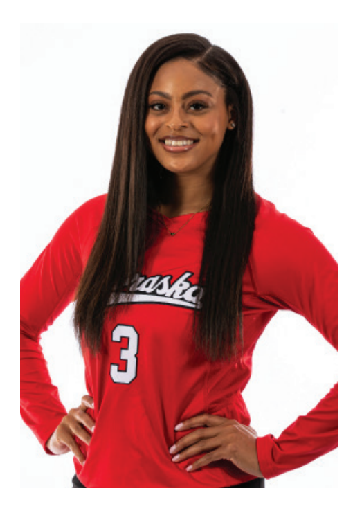
MB • Sr. • 6-0 Chicago, III. Mother McAuley/Missouri