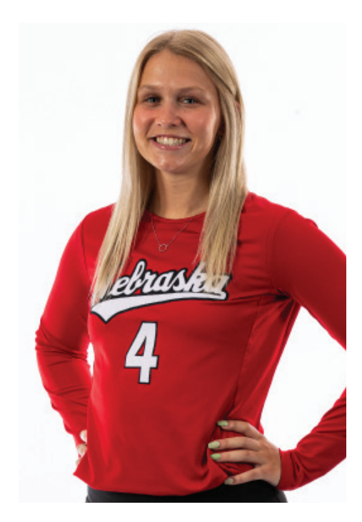
S • So. • 5-9 Waverly, Neb. Waverly