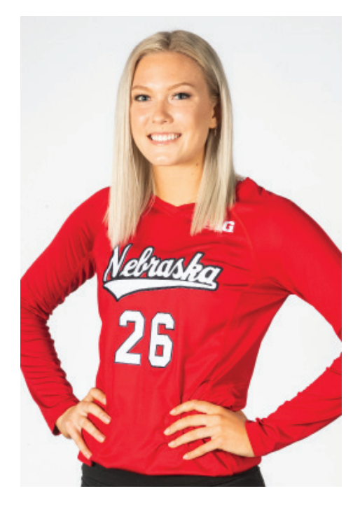
MB • Sr. • 6-4 Scottsdale, Ariz. Chaparral