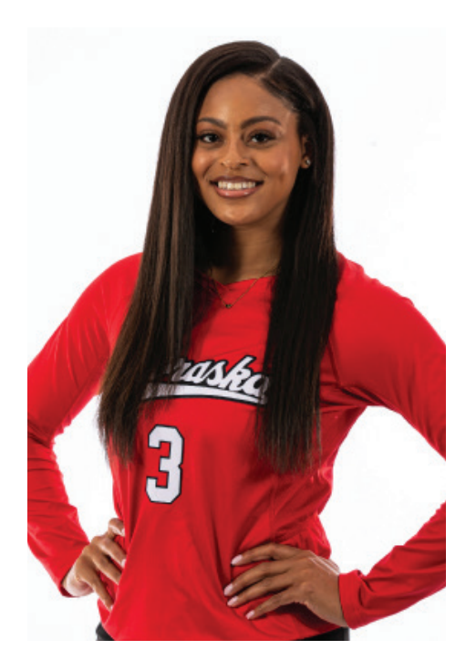
MB • Sr. • 6-0 Chicago, III. Mother McAuley/Missouri