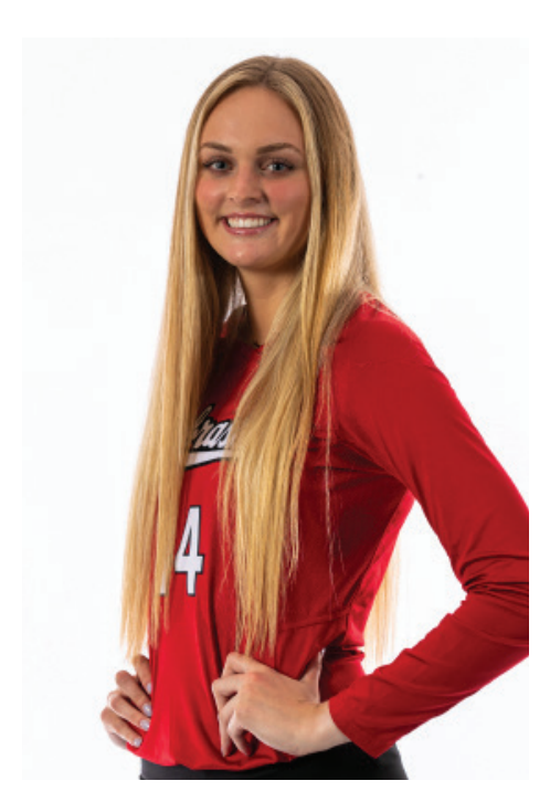
OH • Fr. • 6-4 Houston, Texas Seven Lakes