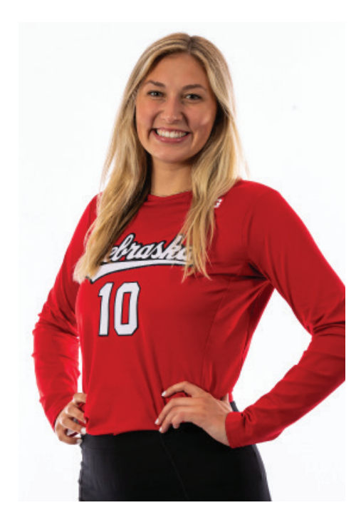
OH • Jr. • 6-3 West Des Moines, Iowa Valley