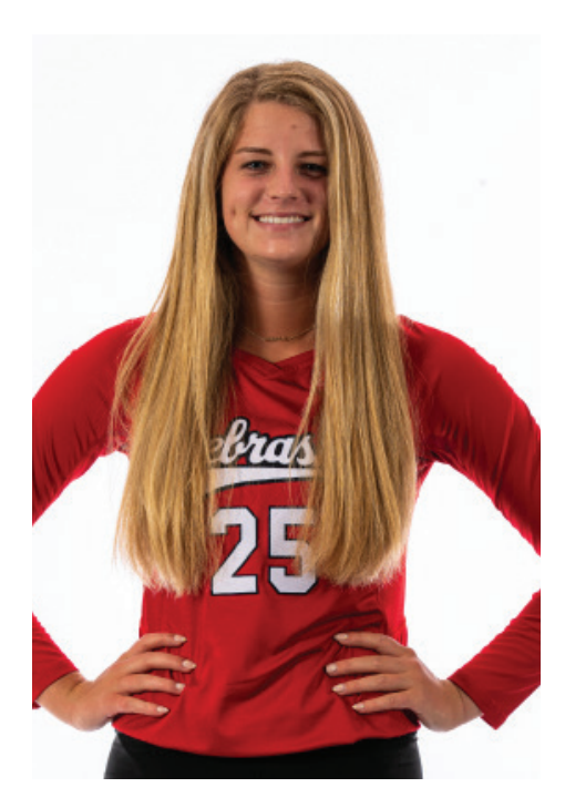
MB • Sr. • 6-5 Kearney, Mo. Kearney