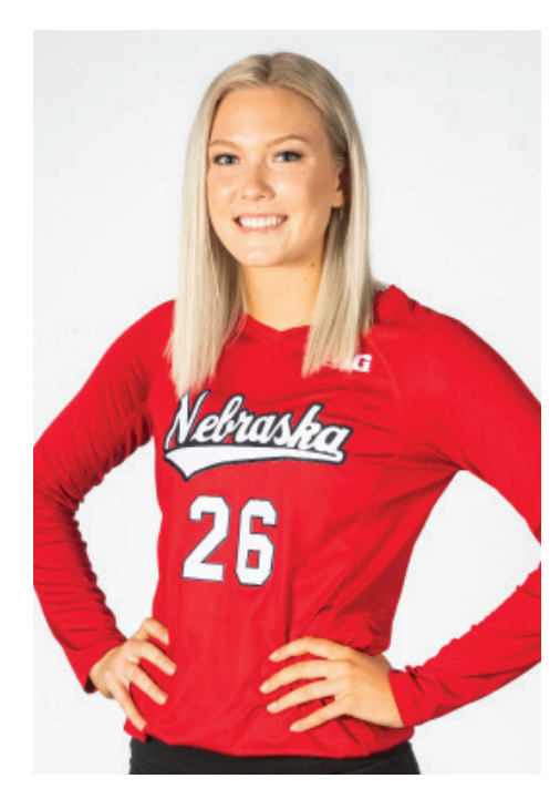
MB • Sr. • 6-4 Scottsdale, Ariz. Chaparral