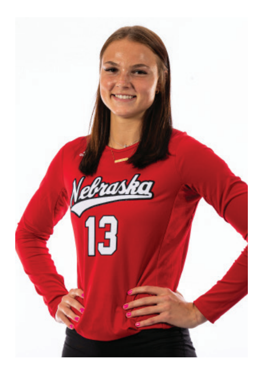
OH • Fr. • 6-2 Waverly, Neb. Waverly