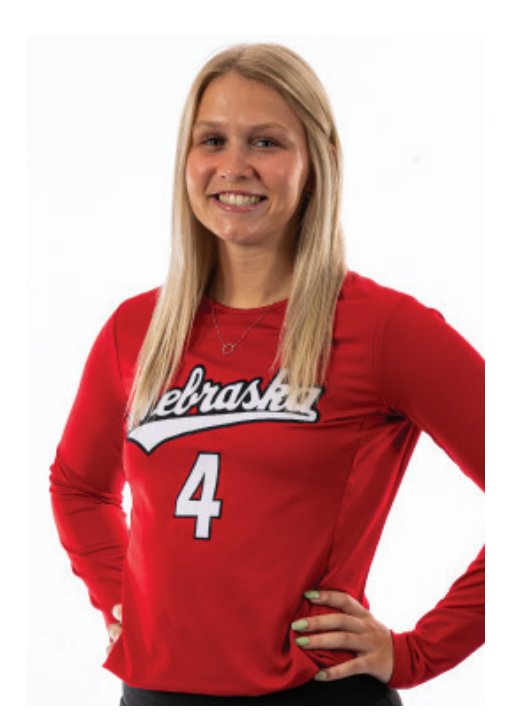
S • So. • 5-9 Waverly, Neb. Waverly