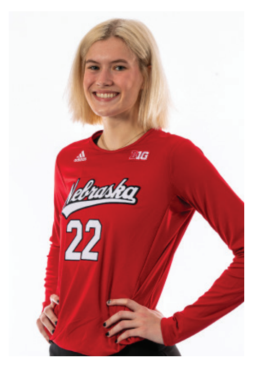
OH • Fr. • 6-4 Omaha, Neb. Skutt Catholic