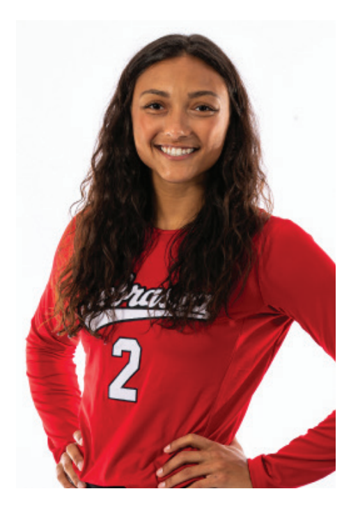
DS/L • Jr. • 5-8 Yorktown, Ind. Yorktown