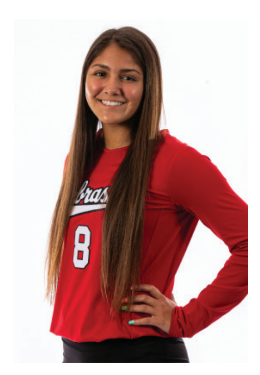
DS/L • Fr. • 5-5 Sterling, III. Sterling