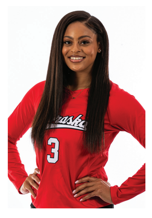
MB • Sr. • 6-0 Chicago, III. Mother McAuley/Missouri