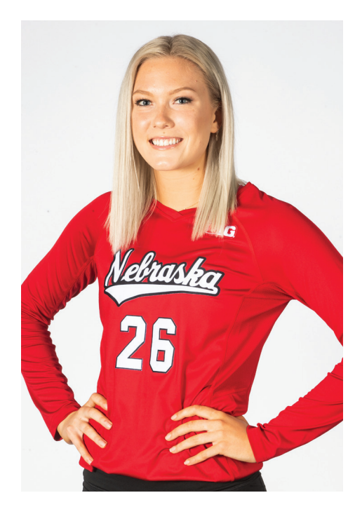
MB • Sr. • 6-4 Scottsdale, Ariz. Chaparral