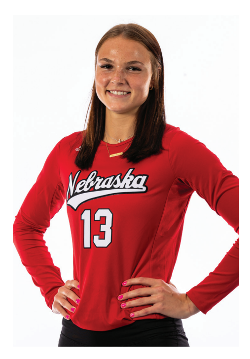
OH • Fr. • 6-2 Waverly, Neb. Waverly