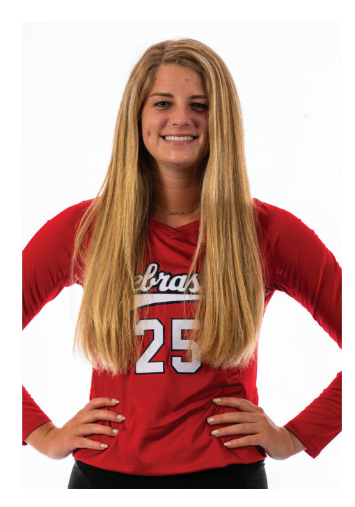
MB • Sr. • 6-5 Kearney, Mo. Kearney