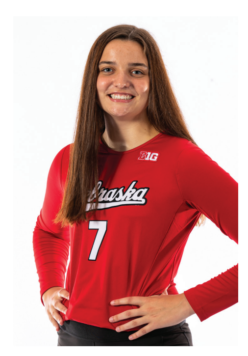
MB • Fr. • 6-4 Elkhorn, Neb. Elkhorn South