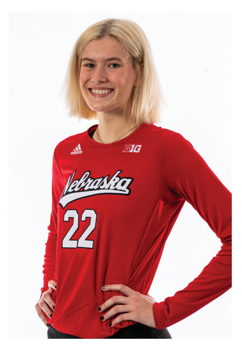
OH • Fr. • 6-4 Omaha, Neb. Skutt Catholic