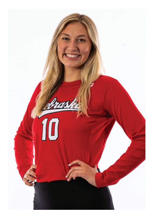
OH • Jr. • 6-3 West Des Moines, Iowa Valley