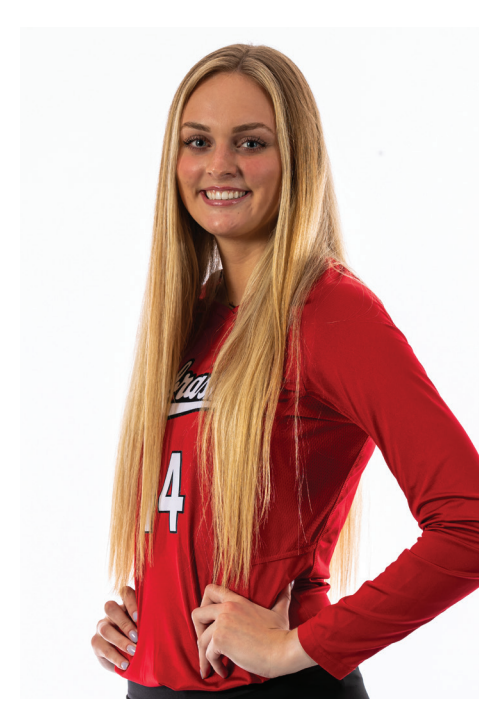
OH • Fr. • 6-4 Houston, Texas Seven Lakes