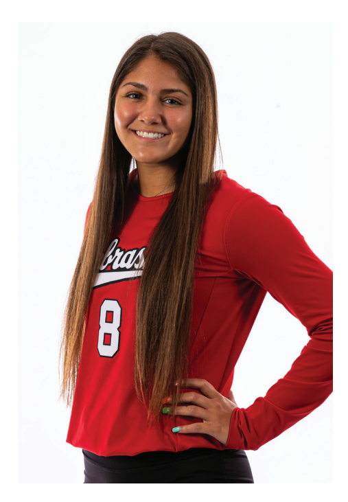
DS/L • Fr. • 5-5 Sterling, III. Sterling