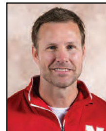
FRED HOIBERG Head Coach