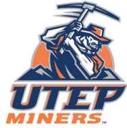
GAME 02 vs. UTEP FEB. 7 | 12:30 PM CT