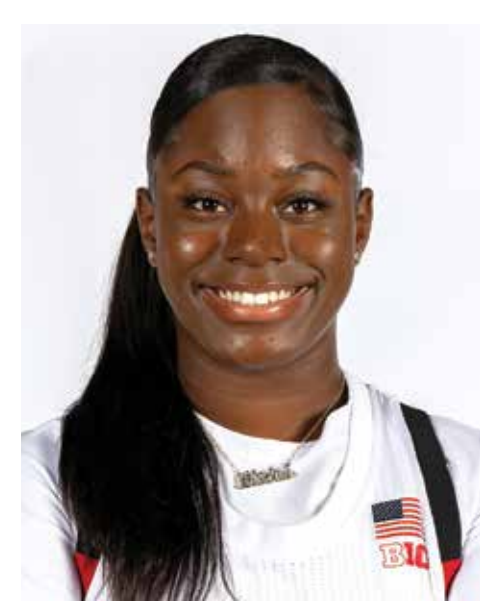
HONORS & AWARDS