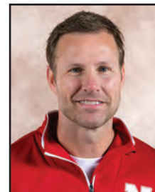
FRED HOIBERG Head Coach