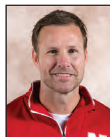
FRED HOIBERG Head Coach