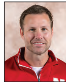
FRED HOIBERG Head Coach