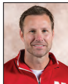
FRED HOIBERG Head Coach