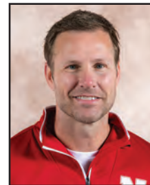
FRED HOIBERG Head Coach