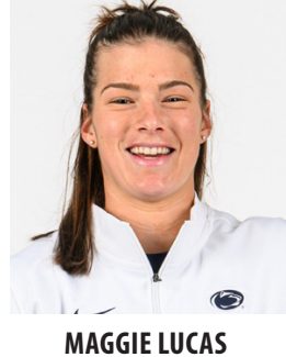
Assistant Coach First Season Penn State '14