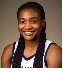
G | Sr. | 6-1 Maputo, Mozambique