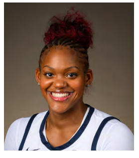
F | So. | 6-3 Beltsville, Md.