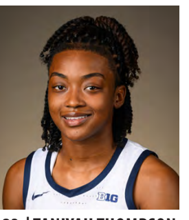
G | Sr. | 5-11