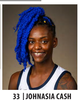
F | Gr. | 6-3 McKeesport, Pa.