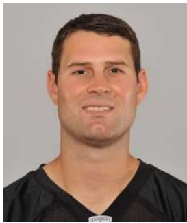
CHAD HENNE, QB Kansas City Chiefs 14th Season