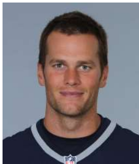
TOM BRADY, QB Tampa Bay Buccaneers 22nd Season