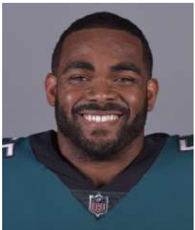
BRANDON GRAHAM, DE Philadelphia Eagles 12th Season