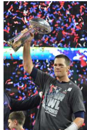
Tom Brady 7-time Super Bowl Champion 5-time Super Bowl MVP