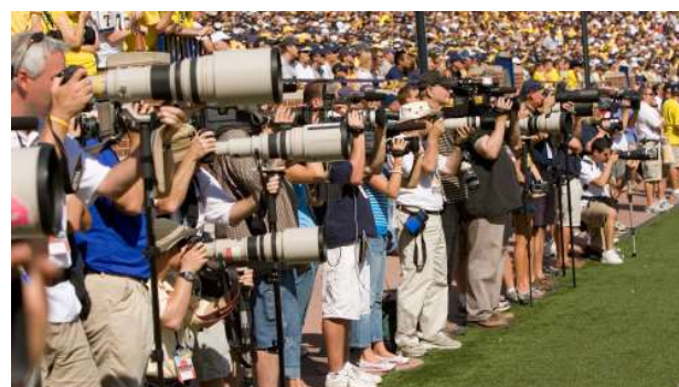
Michigan leads all of college football in television appearances