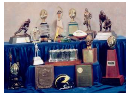
11 National Titles & 42 Big Ten Championships