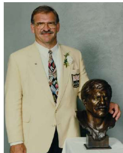
Dan Dierdorf 1996 Pro Football Hall of Fame Inductee; one of 11 Wolverines enshrined