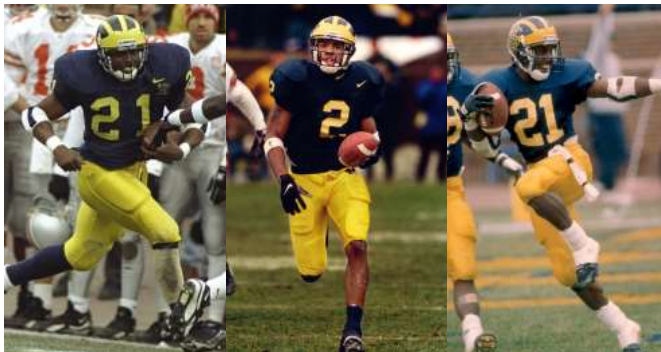
"The Game" between Michigan and Ohio State has been selected as the greatest rivalry in all of sports