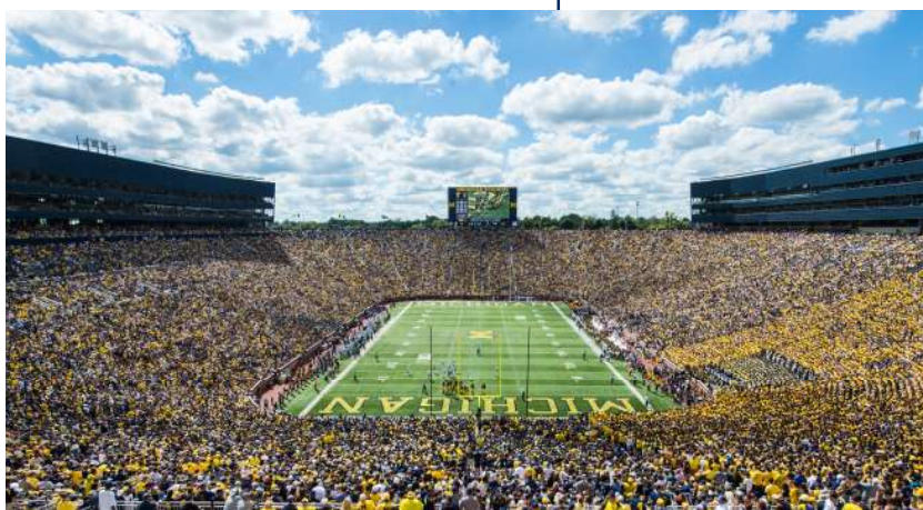
Michigan Stadium (107,601) is the largest venue in college and professional football