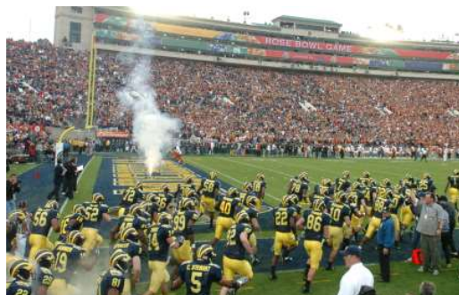
20 Rose Bowl Appearances The most of any Big Ten Conference school and the second-most all-time by any school