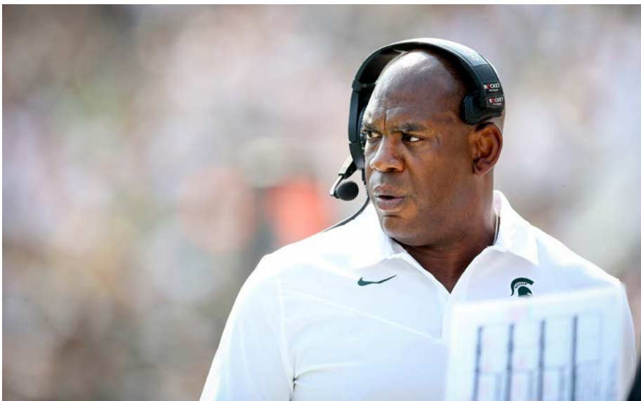
Mel Tucker has been named to National Coach of the Year Watch Lists by the Dodd Trophy and the Paul "Bear" Bryant Award.