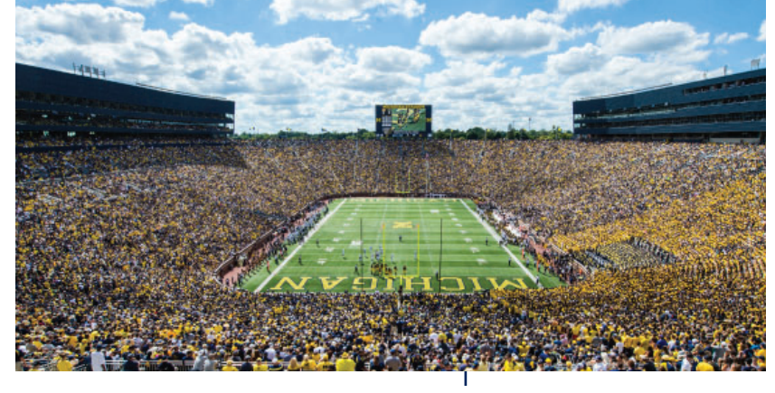
Michigan Stadium (107,601) is the largest venue in college and professional football