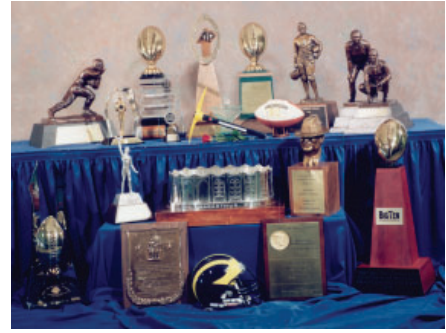
11 National Titles & 42 Big Ten Championships