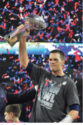
Tom Brady Five-time Super Bowl Champion Four-time Super Bowl MVP