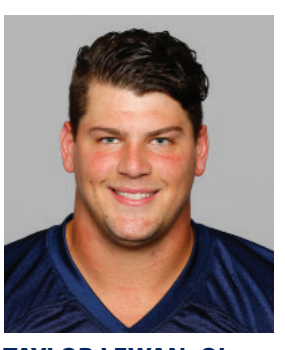
TAYLOR LEWAN, OL Tennessee Titans 6th Season