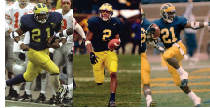
"The Game" between Michigan and Ohio State has been selected as the greatest rivalry in all of sports