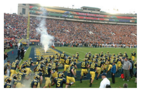
20 Rose Bowl Appearances The most of any Big Ten Conference school and the second-most all-time by any school